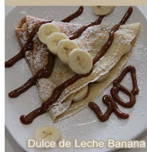
Dulce de Leche Banana