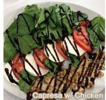
Capresa w/ Chicken