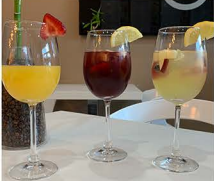
Wine / Mimosa / Sangria